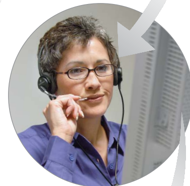
Captioning Center Operator converts everything the standard phone user says into written text using voice recognition technology.