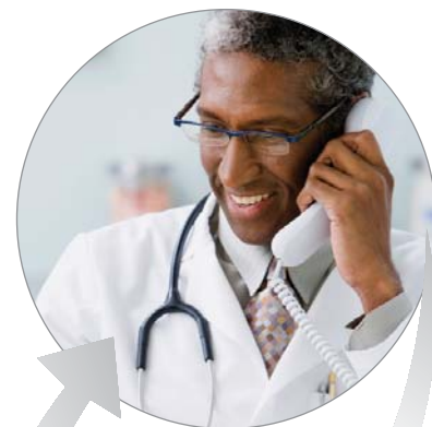
Family, friends and businesses use a standard telephone to communicate freely.

CapTel user uses a special telephone that includes a screen which displays text of the other party's conversation. User has the opportunity to both hear and read the other party's conversation.